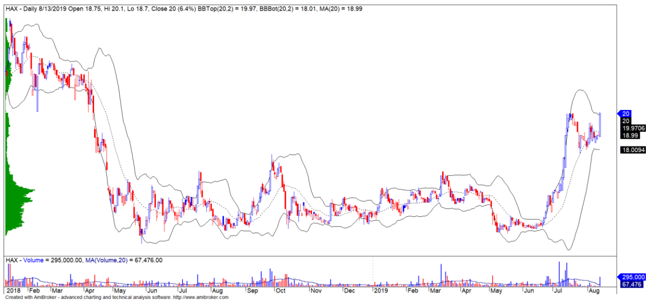
HAX 股票的價格走勢圖

(*) 股票評級 Stock Rating 是企業股票價格基本增長與相對強弱與越南股市三大證交所剩餘股票相比的相關性比較。