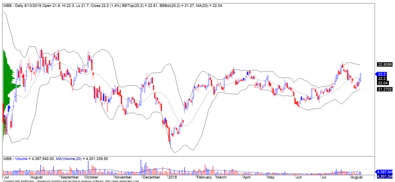
MBB 股票的價格走勢圖