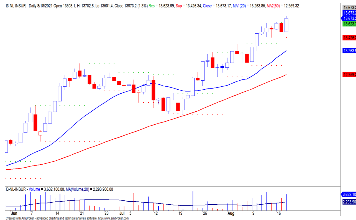
Diễn biến chỉ số NL-Insur.